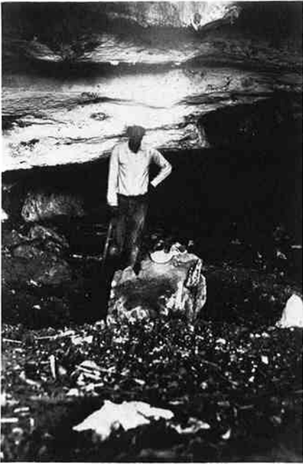
FIGURE 1 Entrance to the Dwelling Cave

At the south side of the cave, where it sloped up to the entrance, a second burial was found. It, too, had been disturbed, although the pelvis and upper ends of the femurs were in place. The burial lay on the rock floor of the cave. A few stray bones belonging to this skeleton were found on the north side of the cave as well (Rainey 1934: 20-22; 1940: 152).